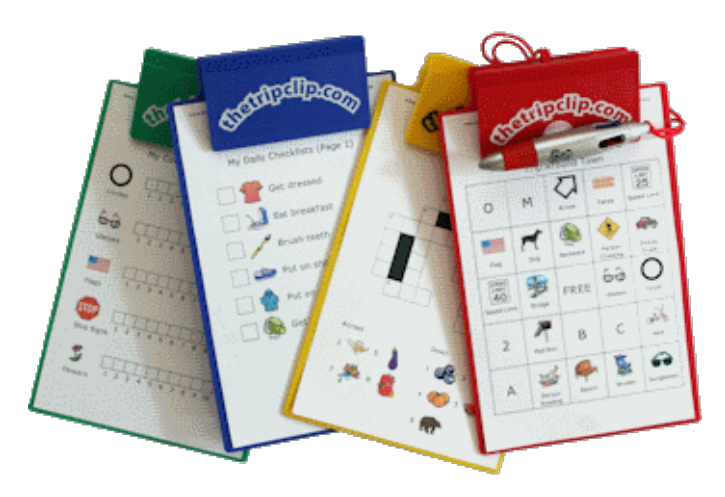
Get yours now

These activities are designed to fit perfectly on a kidsized clipboard: