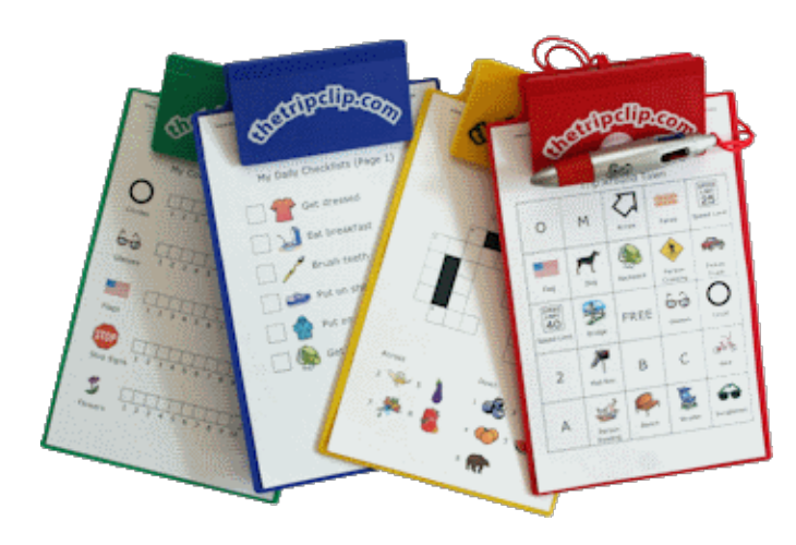
Get yours now

These activities are designed to fit perfectly on a kid-sized clipboard: